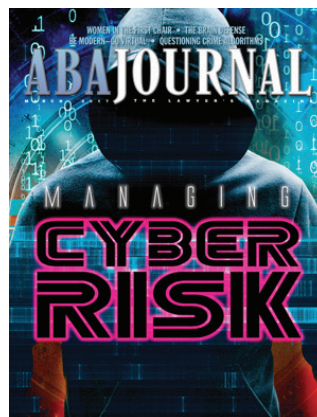
ABA Journal magazine